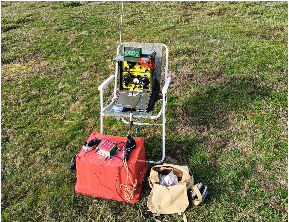
The Morse keypad connected to the trusty '48...(Shock! Horror! A Non-valve accessory!)

Do we call a GROTA exercise with morse a "GROTAM"?