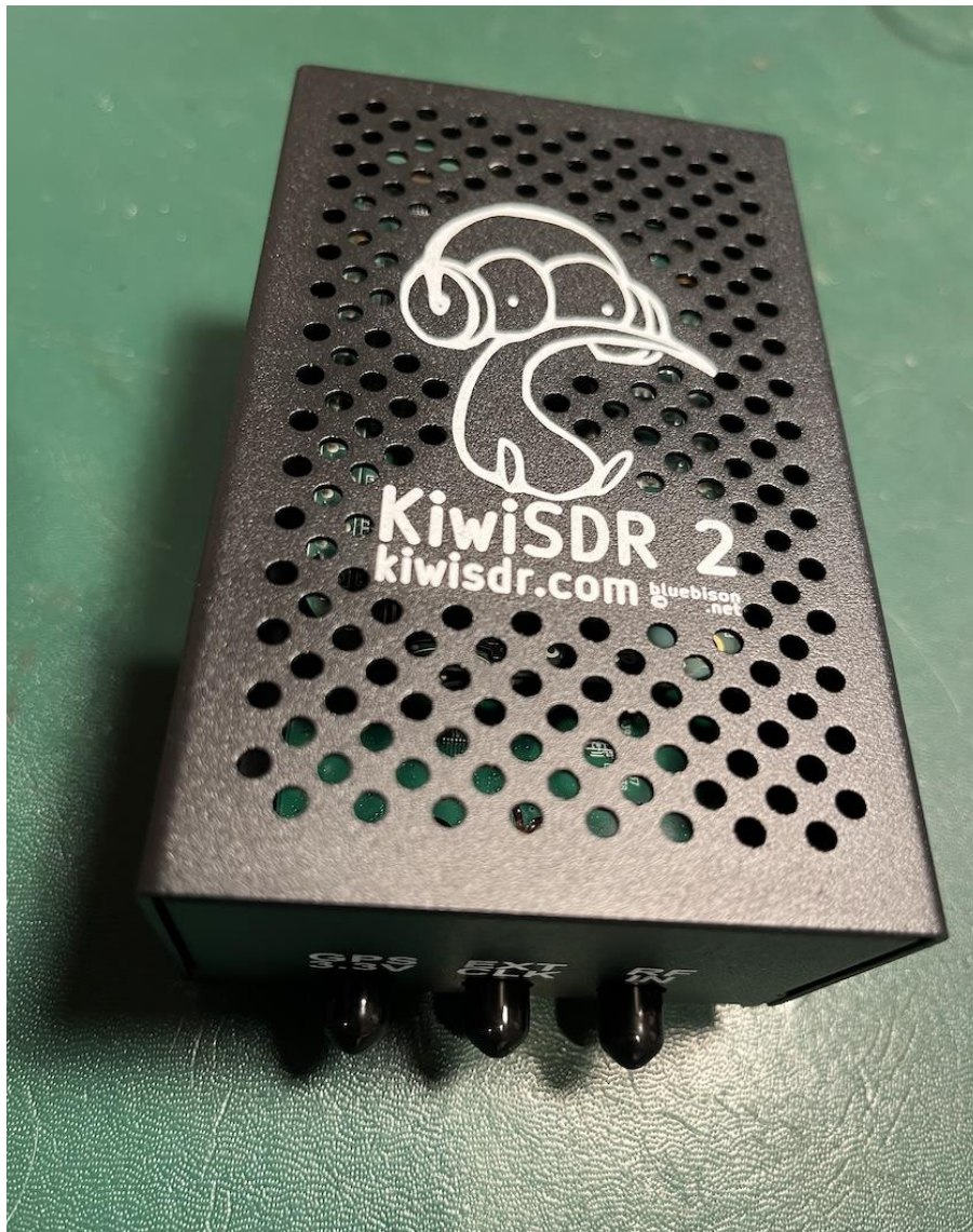
The new SPAM Kiwi SDR.

We hope that someone (preferably in the south) could host it as we really need a good SDR for those southerners in the AM group-especially the GROTarians of ZL3.