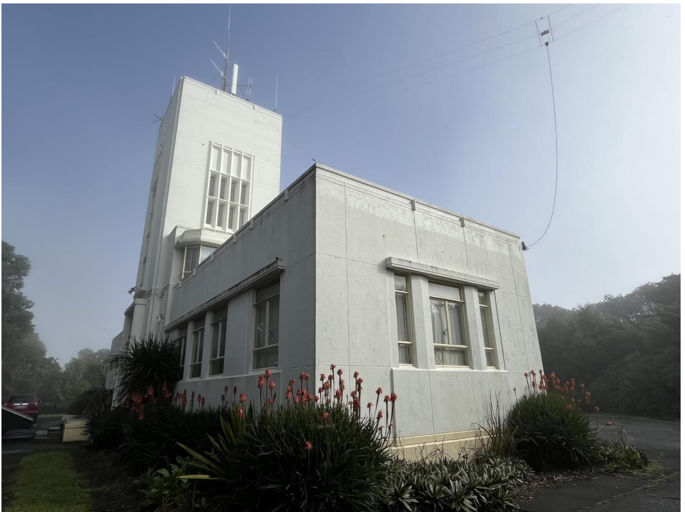
Musick Point Memorial Radio Station on a recent foggy morning.

NEXT MEETING- Sunday August 11th at 1pm. Coffee and tea provided!