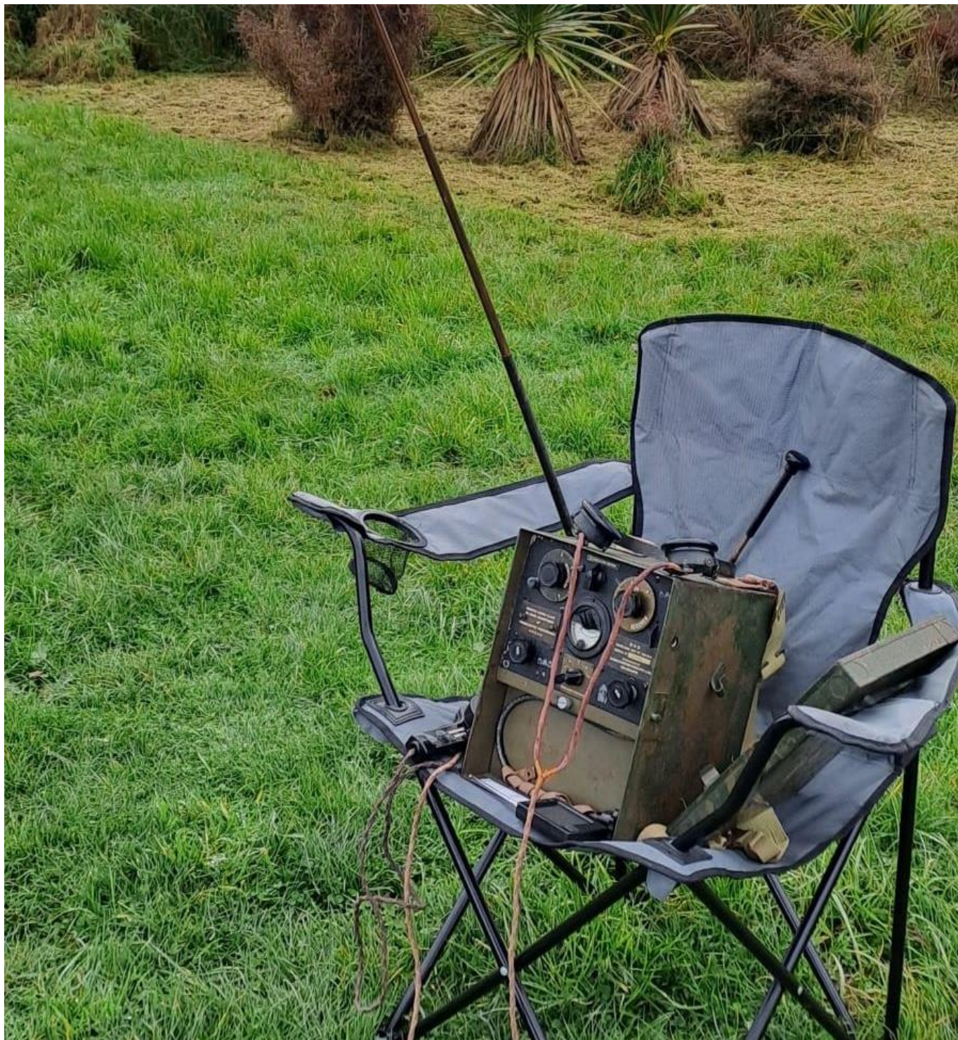
A newcomer to the GROTA stables- the W.S.108- CW only!