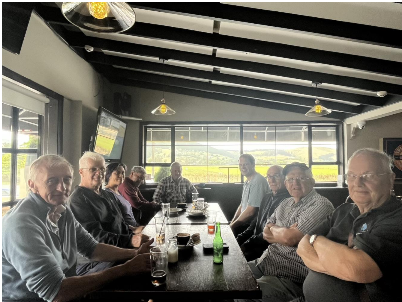
Happy Grotarians 'comparing notes' at the TaiTapu pub.