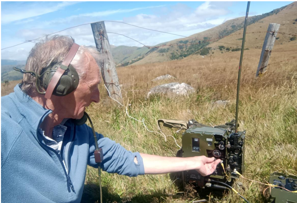
ZL3KB in action at the Port Levy Saddle with the A13.