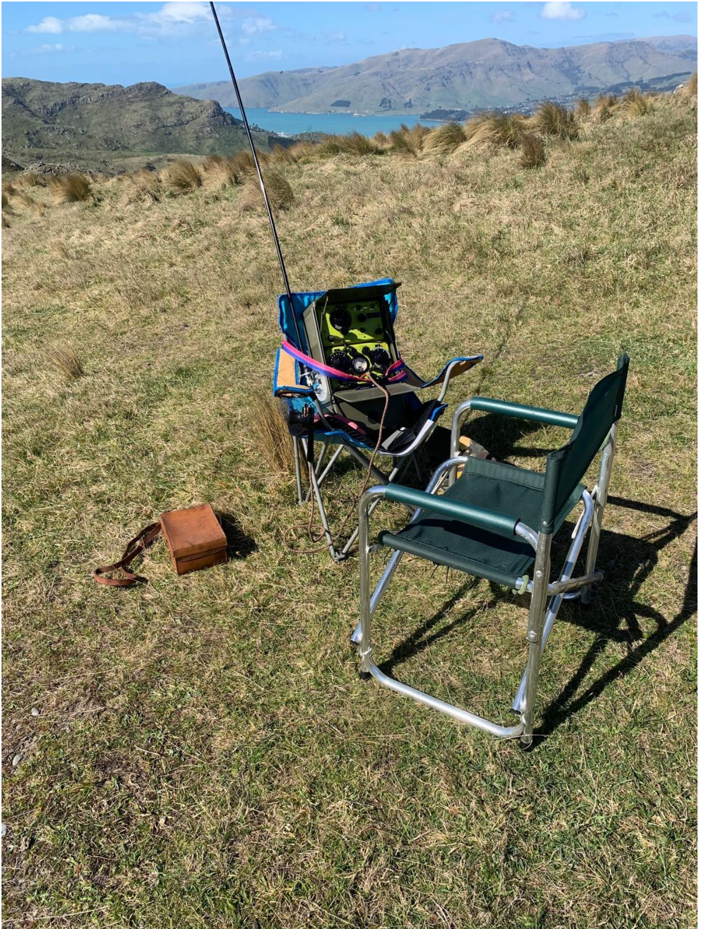
Bruce ZL3TFM's WS.48 at Mt Vernon