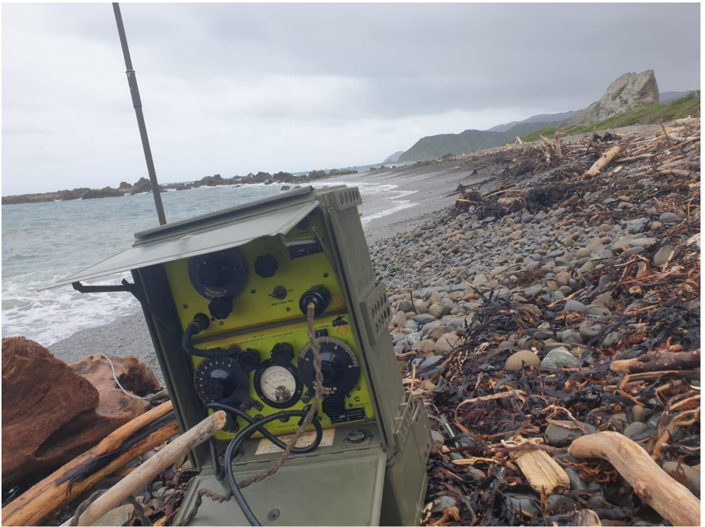
Hugh ZL2ASB WS.48 at Tarakena Bay on the Wellington coast