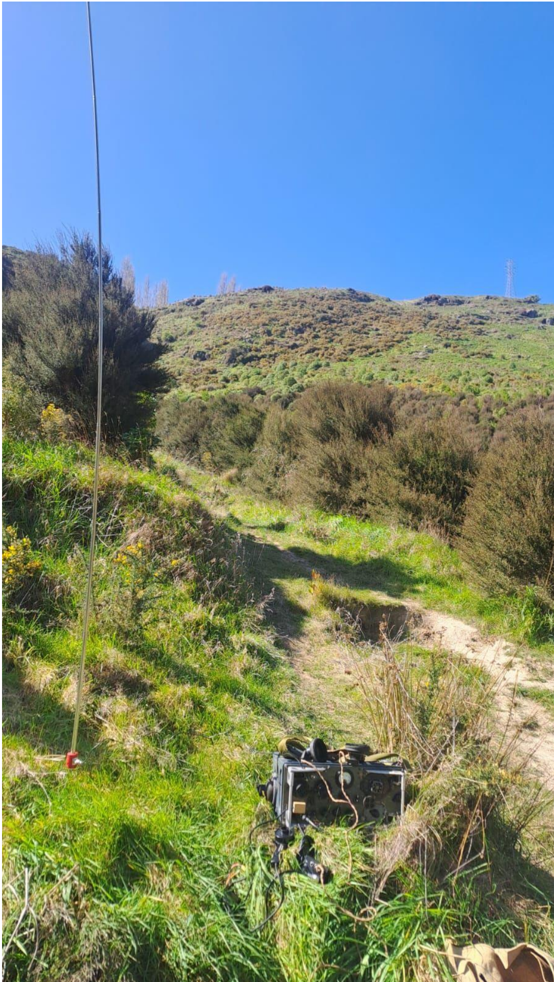
Aidan ZL3APB's WS.62 set up on the Bowenvale track.